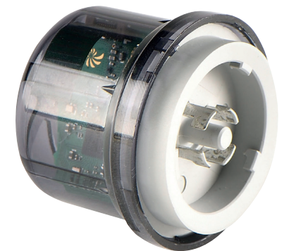
Dimensions: Ø 40 x H 45mm