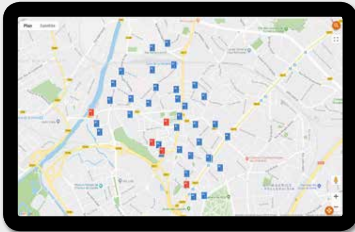
Screen shot from the welcome screen showing the status of all the street lighting cabinets Available with Tegis Lighting and Tegis Lighting Plus