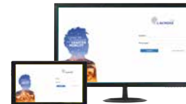
LX Connect online platform, Tegis Astroconnect functions (see p. 56-59)