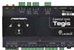
Tegis Astroconnect control unit (see p. 50-51)