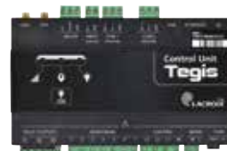
Tegis Astro control unit (see p. 50-51)